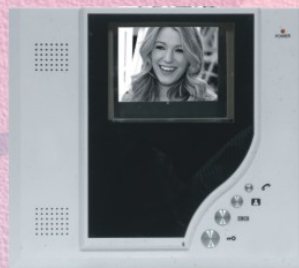
Audio/Video Door Monitor

220 Wt. Operated Passive Infrared Light Sensor, 1000Wt. Capacity With Day & Night Mode & auto Timer Circuit.