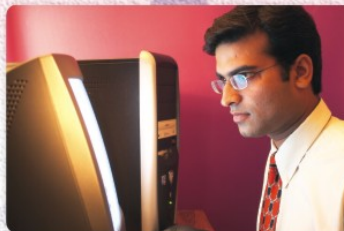
Central Monitoring Station 24x7 for Alarm event feedback