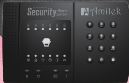
Main Control Panel at hidden location