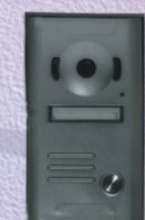
Video Door Bell