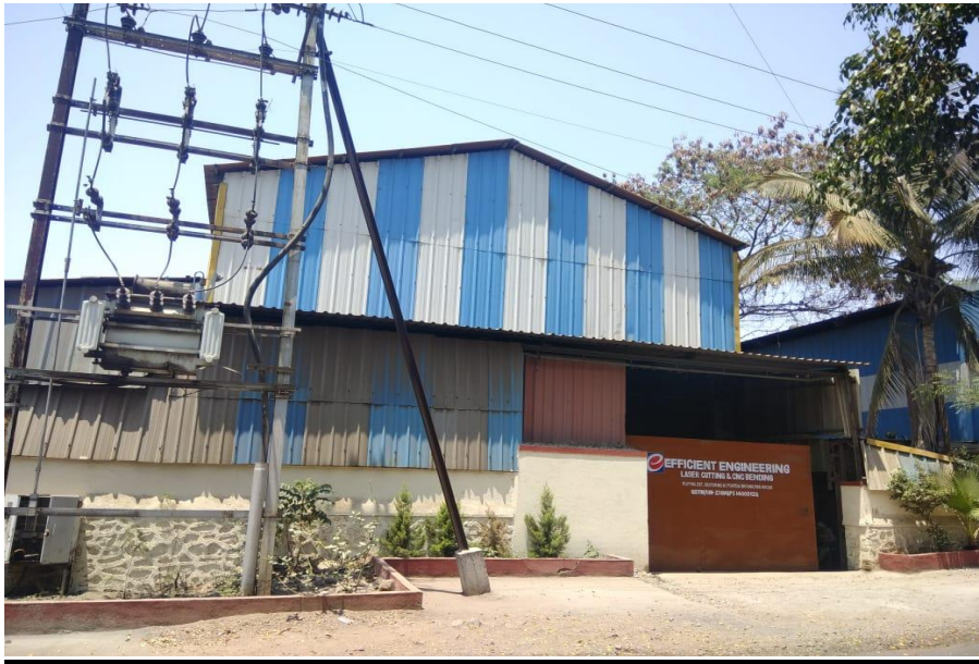
EFFICIENT ENGINEERING LASER CUTTING / CNC BENDING UNIT AREA – 10,000 SQ.FT.