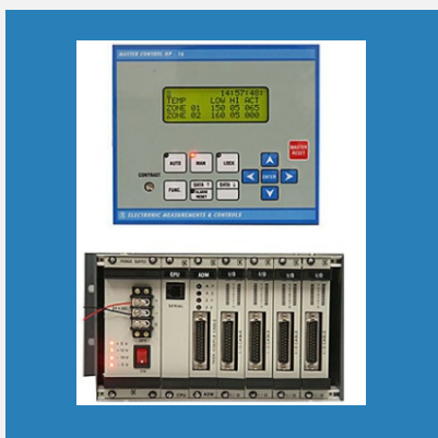
Programmable Logic Controller (PLC HP-14)