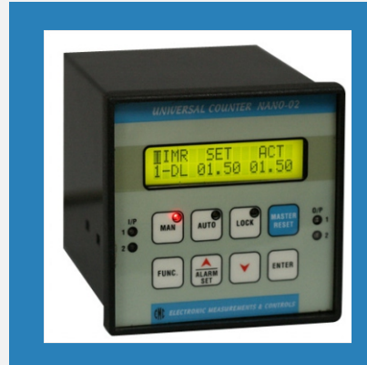
Nano Programmable Logic Controller (02)