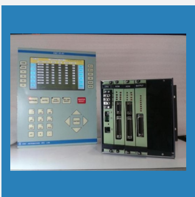
Multi zone Hot Runner Temperature Controller