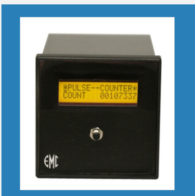
8 Digit Counters