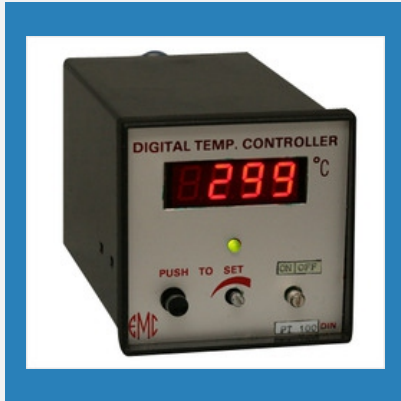
Digital Temperature Controller Push To Set