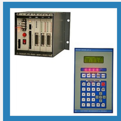
Programmable Logic Controller (PLC HP-12)