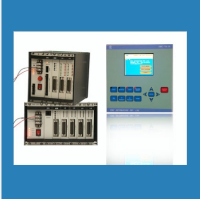
Programmable Logic Controller (PLC TS-35)