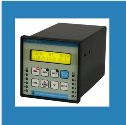
Nano Programmable Logic Controller (01)