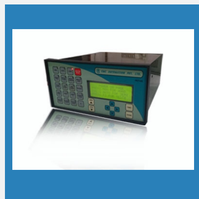
Programmable Logic Controller (PLC PET-02)