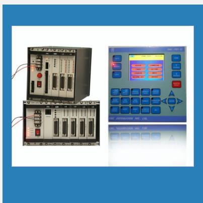
Programmable Logic Controller (PLC PET-01)