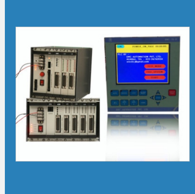
Programmable Logic Controller (PLC TS-57)