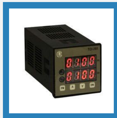
Temperature Controller (TCI-201)