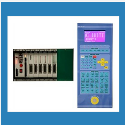
Programmable Logic Controller (PLC INJ-02)