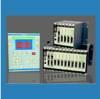
Programmable Logic Controller (PLC TS-01)