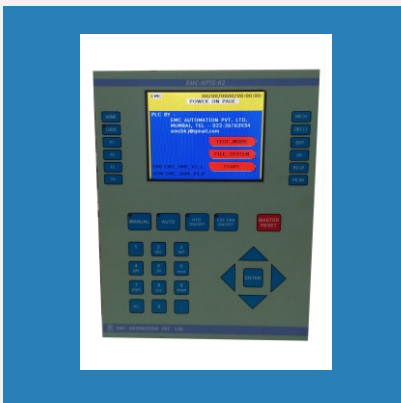
Programmable Logic Controller (PLC HPTS-02)