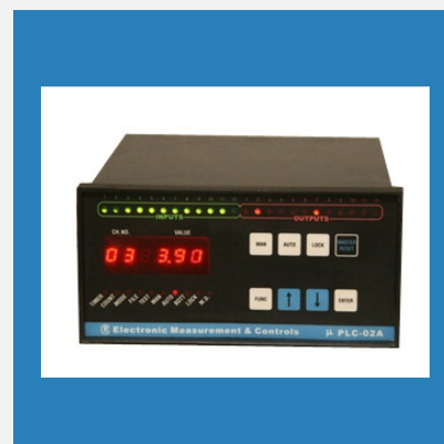
Programmable Logic Controller (Micro PLC)