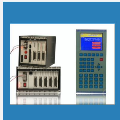
Programmable Logic Controller (PLC INJ-57)