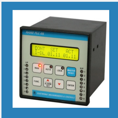
Programmable Logic Controller (PLC 04,06,08)