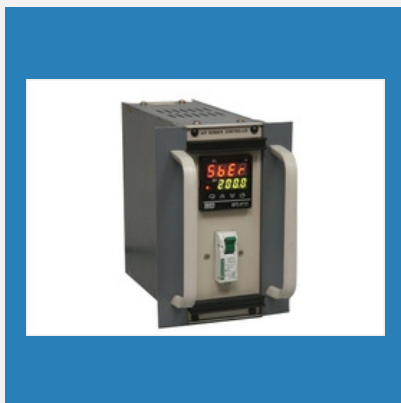
Hot Runner Temperature Controller