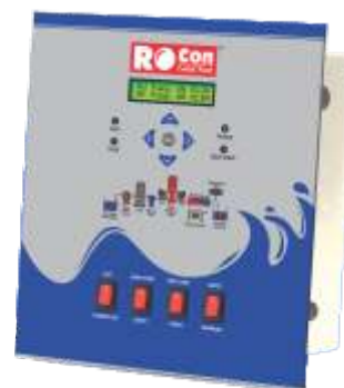
ROCon Steel Series