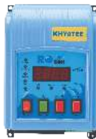
ROCon Eco 11