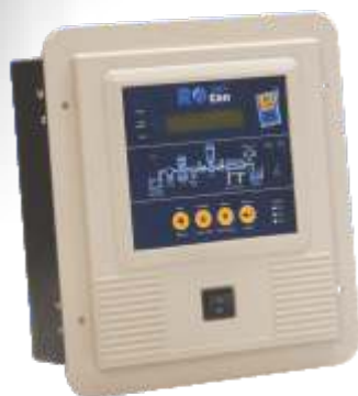
ROCon ABS Series