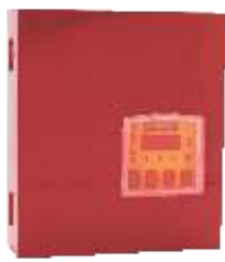
Model: KDP 99 (MS)