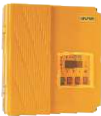
Model: KDP 99