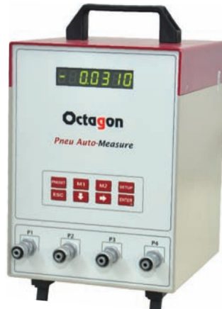
Pneu-Auto Measure Multi channel air electronic gauging display

Octagon 'Pneu Auto Measure' and 'Pneu Smart Measure' are multi channel air gauging display units featured with auto detection of channel input. Both units have built in PIEZO sensor suitable to be used with different pneumatic gauges e.g. Air Plug Gauges , Air Ring Gauges , Air caliper Gauges of various makes.