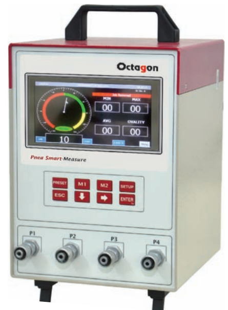
Pneu-Smart Measure Multi channel air electronic gauging display

Octagon also offers Pneu Measure a single channel Digital Display with built in PIEZO sensor suitable to be used with different pneumatic gauges e.g. Air Plug Gauges , Air Ring Gauges , Air caliper Gauges of various makes.