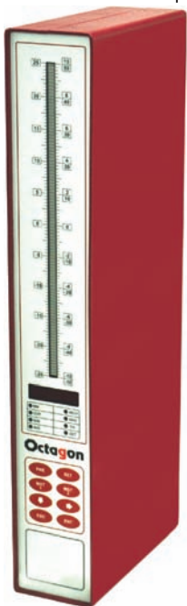
Electronic Column Gauge : Gauging Display

The tolerance values are superimposed on the bar for operator's assistance. Advanced microcontroller based hardware along with a very simple to understand menu makes it very user friendly. 2 point auto calibration facility makes calibration easy & quick. Flexibility in settings makes the column a real versatile tool for quality checking for mass production of work pieces.