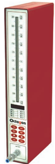
PIEZO sensor based Air Column Gauge : Gauging Display