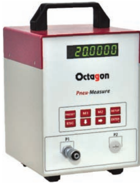
Pneu-Measure Single channel air electronic gauging display