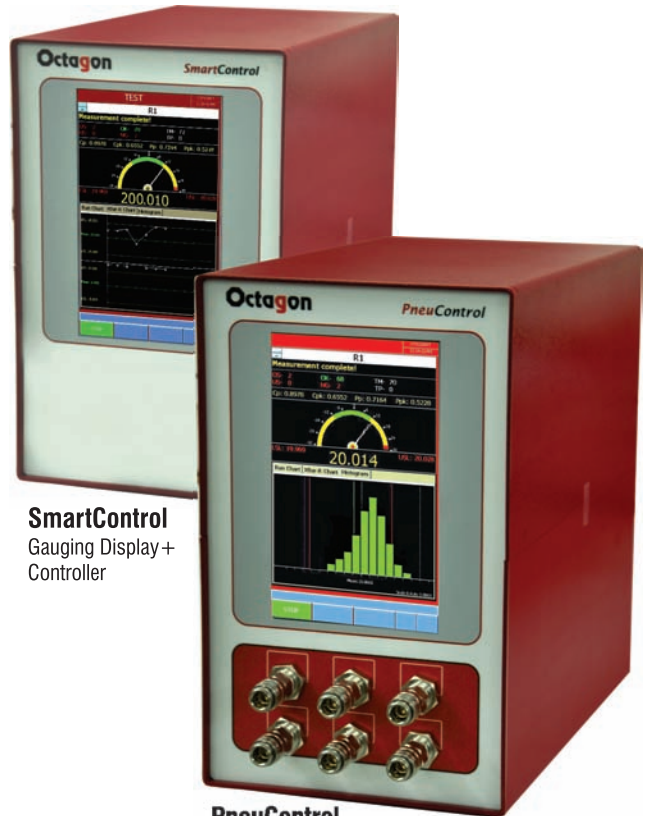
SmartControl Gauging Display + Controller