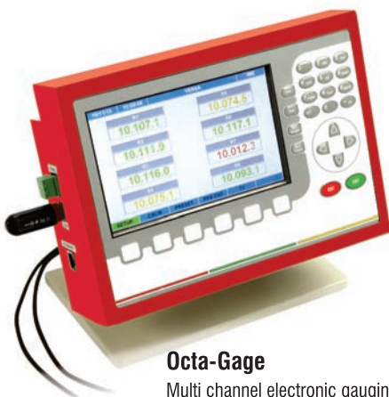
Octa-Gage Multi channel electronic gauging display

Octagon's digital displays are single / multi channel digital displays suitable for gauging applications especially for multi gauging systems with Inductive sensors.