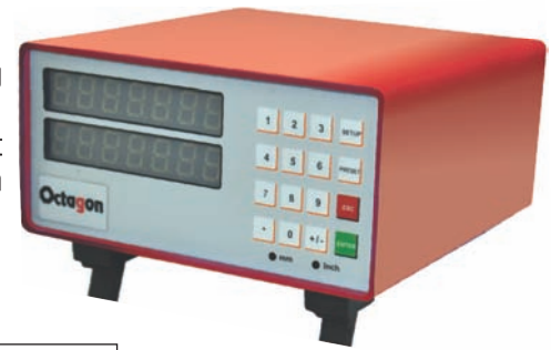
Single / Multi Channel Digital Display for Inductive sensors

Seven segment displays, the user can set it for measurements in comparative mode. 2 point auto calibration facility makes calibration easy & quick. Flexibility in settings makes the column a real versatile tool for quality checking for mass production of work pieces.