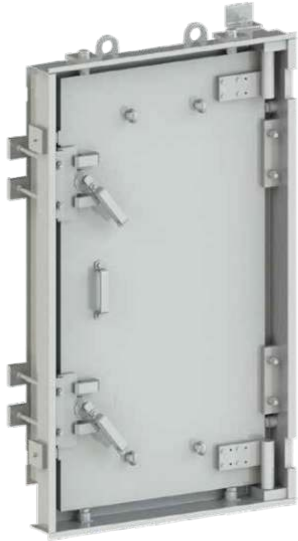
Example of a Betec Temet SO-3 Blast Door

The SO-3 doors are designed to function within the operating temperature range of -30 ... +80 °C.