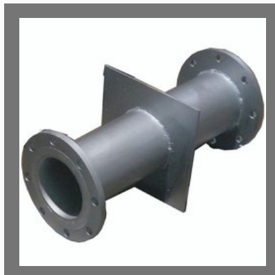
Struts Framing Channel