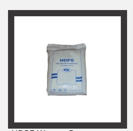
HDPE Woven Bags