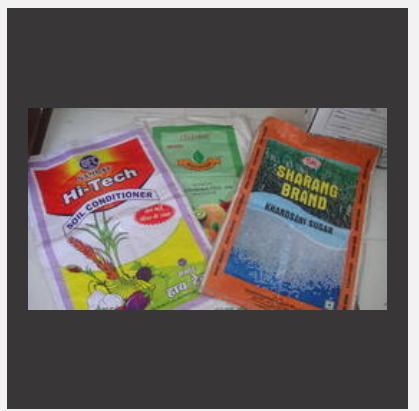
Cattle Feed Bags