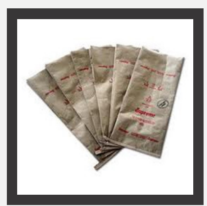
Paper Laminated HDPE Sacks