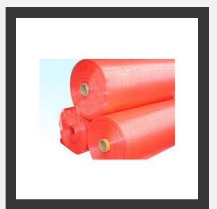
Wide Width Fabrics