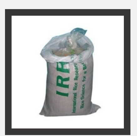
PP Grain Sacks with Liners