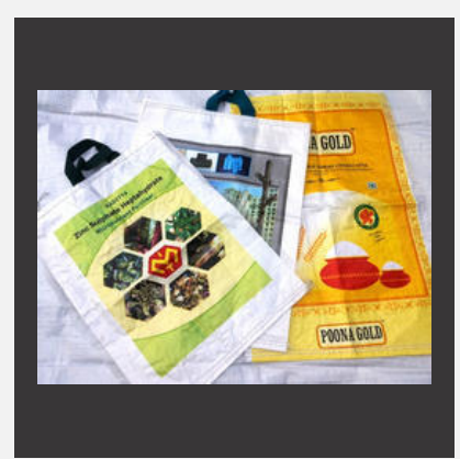
Reverse Printed Bag with Handle