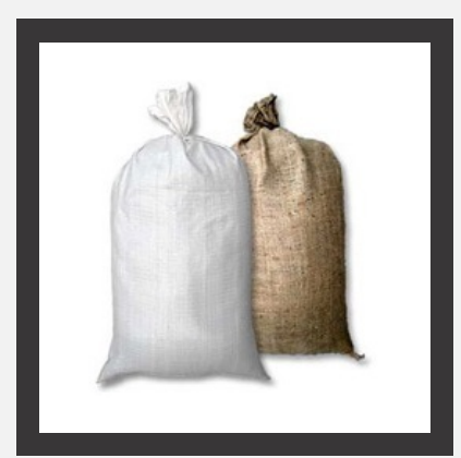
U.V. Stabilizer Sacks