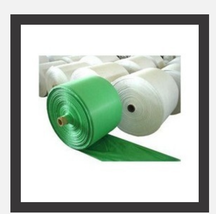
HDPE Woven Fabrics