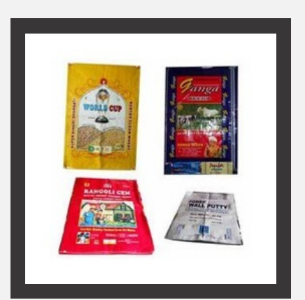
HDPE Laminated Bags