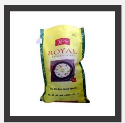
HDPE Rice Bags