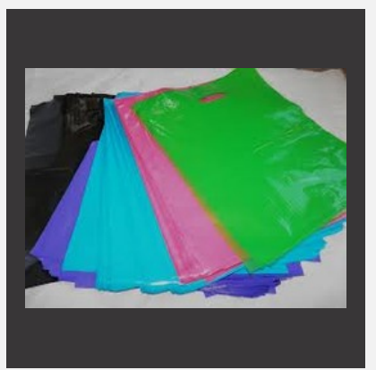
Multi Coloured Handle Bags