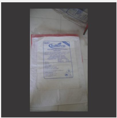
PP/HDPE Woven Bags