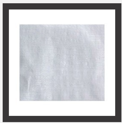
PP Laminated Sheets