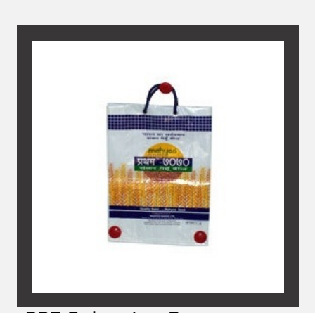
PPE Polyester Bag