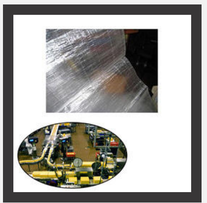
HDPE and PP Woven Sheets for Packing Industry