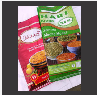
Front and Back Match Reverse BOPP Printed Bags