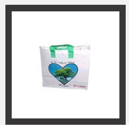
HDPE Gusseted Bags