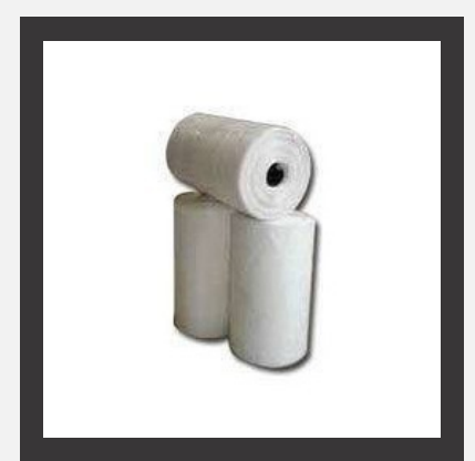
PP Laminated Fabrics