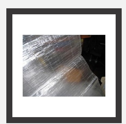
PP Woven Sheets