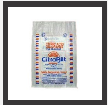
Low GSM Woven Sacks