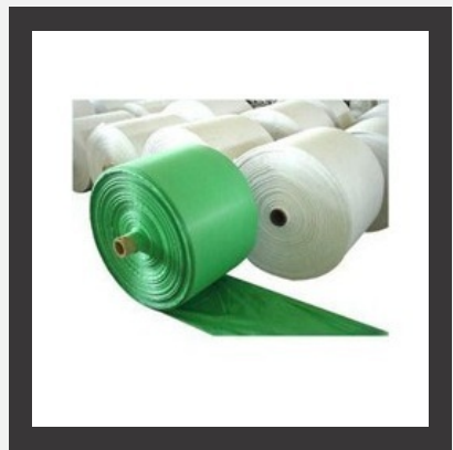
HDPE Woven Sheets