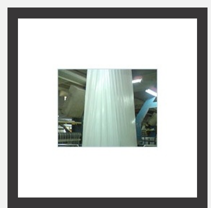
Coated Wide Round-Woven Fabrics