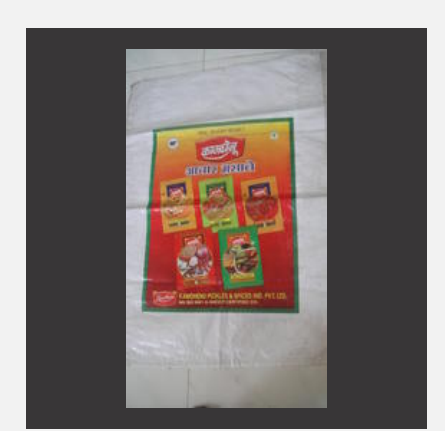
Multi Color Printed Sacks