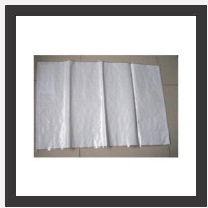
HDPE Laminated Paper