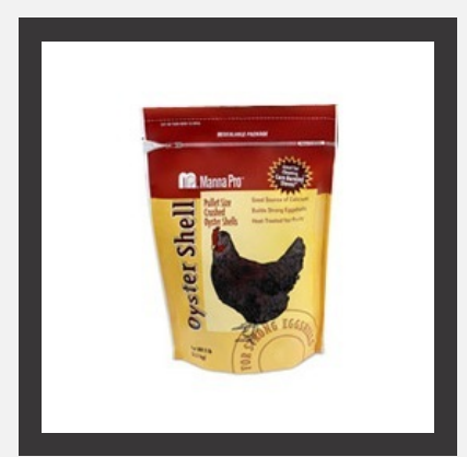
Poultry Feed Bags