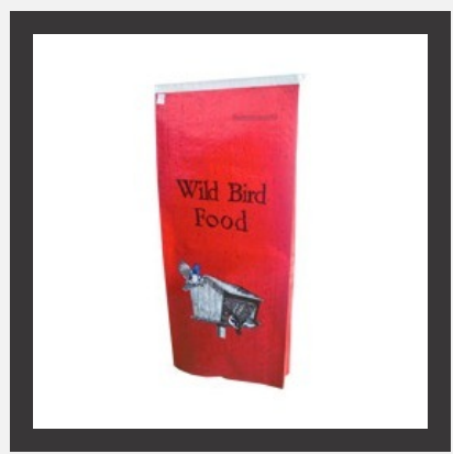
BOPP Poultry Feed Bags