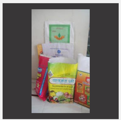
PP / HDPE Bags