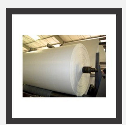
PP Woven Fabrics