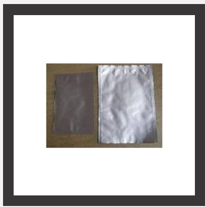
Aluminium Foil Laminated HDPE Bags