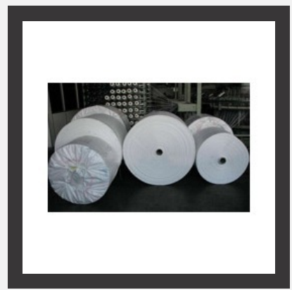
Light Weight Fabrics