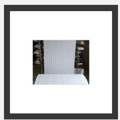
Circular Woven Fabrics Coated