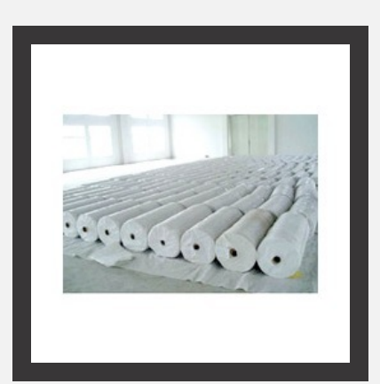
HDPE Laminated Fabrics