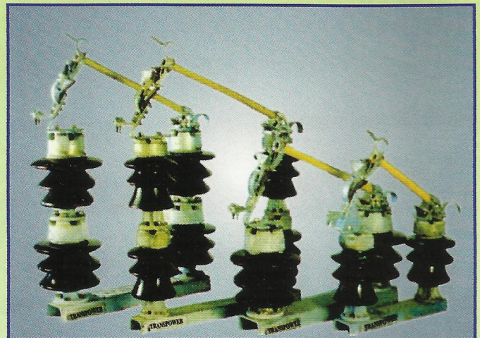
Drop Out Fuse

TRANSPower® Indian made out door, offload Triple Pole, Gang Operated Switch Tilting/Rotating type, Single/Double break consisting of hot dip galvanized channel iron base, Original post type H.T. insulators, Copper or Copper alloy high pressure heavily tinned contacts, plated mild steel orcing horns capable of breaking the magnetizing current complete with horizontal connecting bar G.I. pipe as down rod levers, couplings and operating handle with locking arrangements in voltages upto and including 33 KV line Switchyard and current upto and including 1600 Amps manufactured as per IS 9921 & 1818.