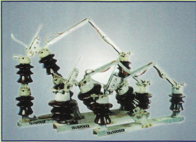
Single Break Isolator Tilting Type