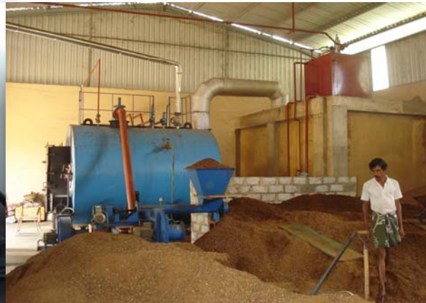
Rice Husk & Saw Dust Fired Steam Boiler.