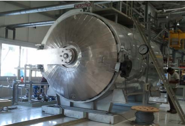
Hot Air Circulation Autoclave