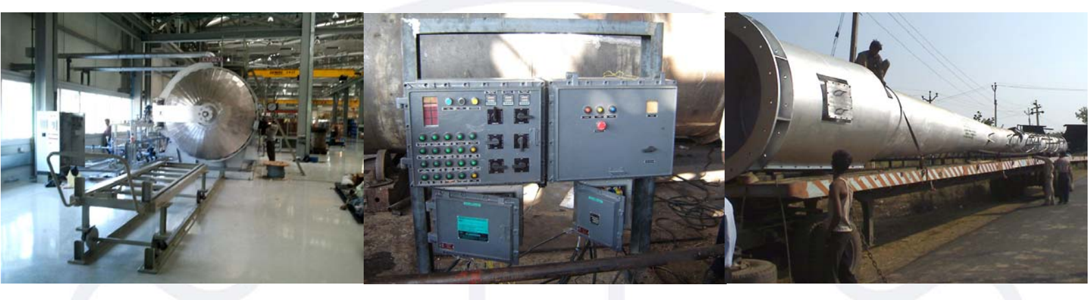
Hot Air Circulation Autoclave