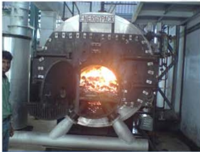
3-PASS FULLY WET BACK