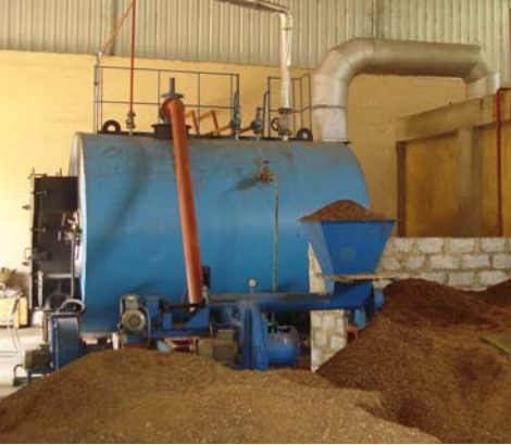
Husk Fired Boiler