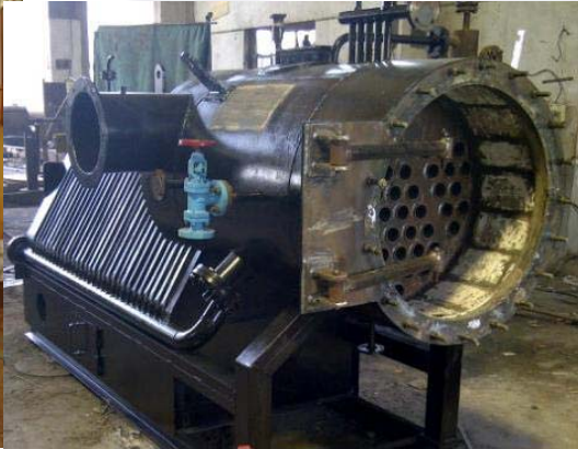
Membrane Wall SIB boiler