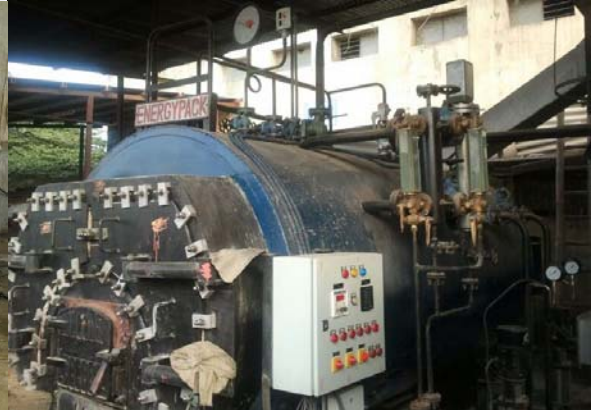
Brette Firing Boiler